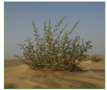
Cornulaca monacantha: good for addax, good for camels and good for controlling desertification.

smaller desert species, including lizards, beetles and gerbils. Addax will often shelter from fierce sandstorms and shade themselves from the burning sun behind especially large specimens. All in all, it's a true keystone species and desert all star.