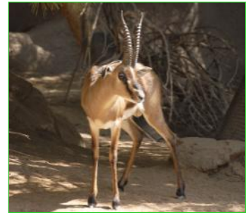
Cuvier's Gazelle at San Diego Zoo.

For all that they do to ensure a future for wildlife in the Sahara, SCF salutes the Zoological Society of San Diego, the San Diego Zoo, and the San Diego Wild Animal Park as true Friends of the Sahara.