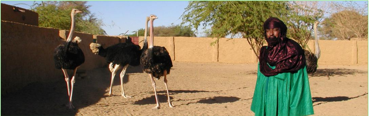
Alhousseini Alghaler of Niger NGO GAGE-Azihar looks after some of the Sahara's last ostriches