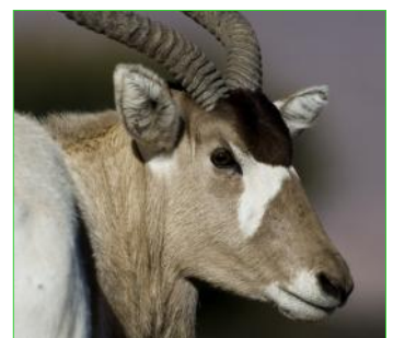
Addax in Tunisia

creatures, including ourselves, the same way we observe stars of the night sky – with unspoken questions hanging from our mouths. To be privy to the eradication of a species and to know damn well what is going on is a shame beyond repair.”